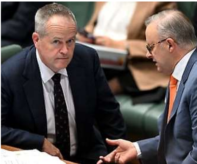
NDIS Minister Bill Shorten pictured in the Australian Parliament with the Prime Minister.

Deafness Forum played a vital role in global advocacy, contributing to international policies on cochlear implant access and participating in the World Hearing Forum. The Forum's ongoing work ensures that Australia's hearing health needs are represented internationally while fostering knowledge exchange with global experts.